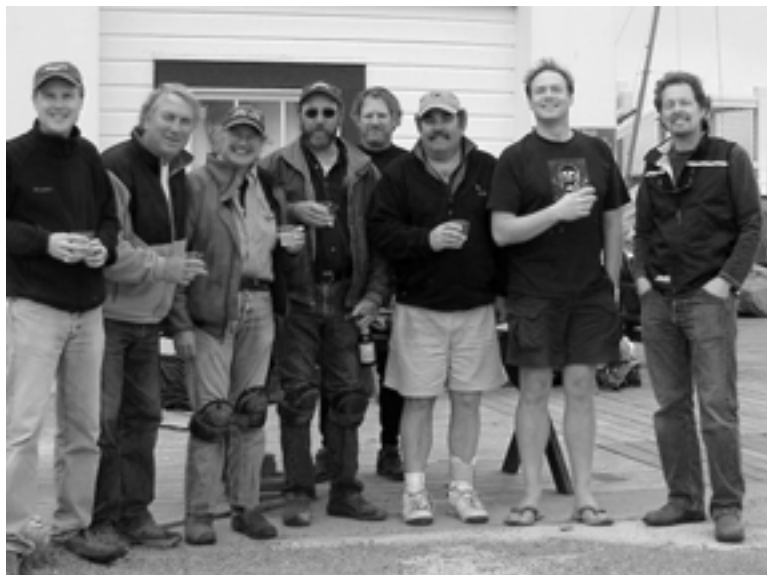
A good portion of the 110 Fleet celebrating an early start to their season.

(Would you risk port tacking this lot??)